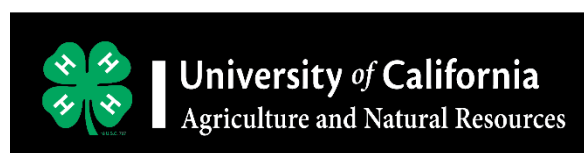
Green clover and white UC ANR logo on black or another color (H's must stay white).