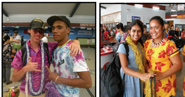
2013/14 AYLP youth participants with host siblings