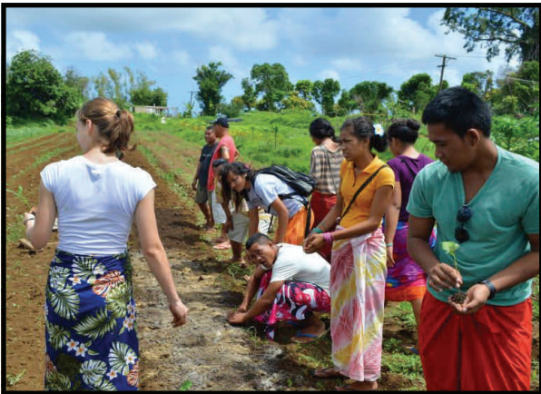
2013/14 AYLP American and Samoan participants at tree farm

The American Youth Leadership Program (AYLP) with Samoa is designed to advance mutual understanding between the people of the United States and Samoa, prepare youth leaders to become responsible citizens, spark an interest in learning about foreign cultures, and develop a cadre of Americans with cultural understanding who are able to advance international dialogue and compete effectively in the global economy.