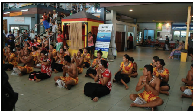
2013/14 AYL welcome ceremony by the Samoan host siblings

The exchange program is sponsored by the U.S. Department of State, Bureau of Educational and Cultural Affairs and administered by the University of Wyoming 4-H Youth Development Program. The program is designed to provide youth an opportunity to develop global leadership skills through increasing multicultural understanding and to positively address nutrition and food security issues affecting our world. We expect participants will return home with the knowledge, skills, confidence, and enthusiasm to create positive change in their schools and communities through small achievable action projects.