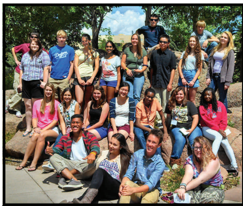
2013/14 AYL American Participants

The exchange program is sponsored by the U.S. Department of State, Bureau of Educational and Cultural Affairs and administered by the University of Wyoming 4-H Youth Development Program. The program is designed to provide youth an opportunity to develop global leadership skills through increasing multicultural understanding and to positively address nutrition and food security issues affecting our world. We expect participants will return home with the knowledge, skills, confidence, and enthusiasm to create positive change in their schools and communities through small achievable action projects.